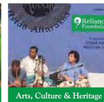
Arts, Culture & Heritage