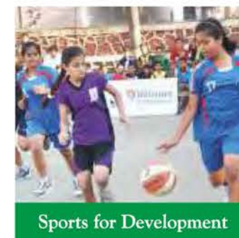
Sports for Development